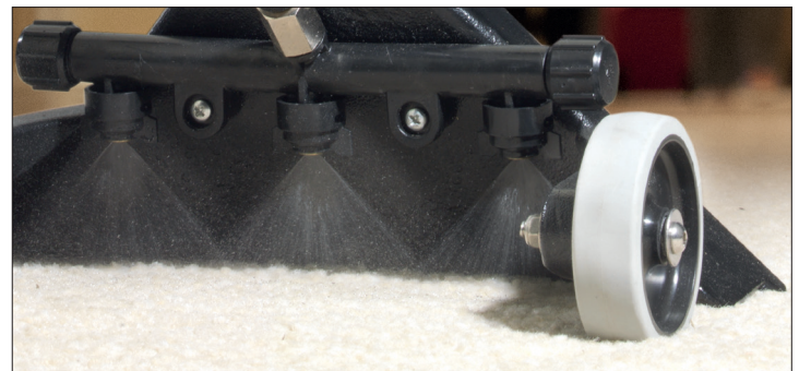
High-performance TriJet Extraction Tool