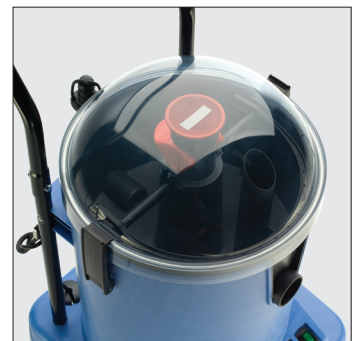
Clear Dome to View Water Levels