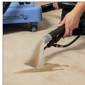
Upholstery and Spot Cleaning Extraction Tool